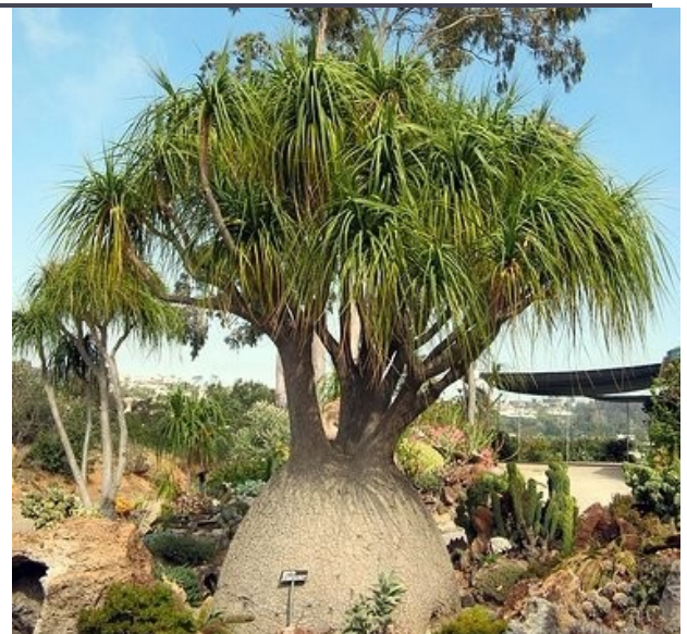
Pony Tail Palm at maturity, ours are much smaller, for now!

The Pony Tail Palm is actually not a palm, but related to agaves and yuccas. It is native to the northern deserts of Mexico, and can grow to be quite large (10-15 feet wide and tall). The Camellia will provide some more color for the Victorian Garden entrance, however we haven't decided on a place for the Elephant Foot Trees. Thanks to Hank!