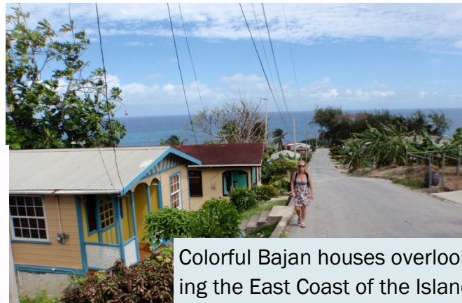
Colorful Bajan houses overlooking the East Coast of the Island