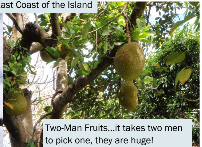
Two-Man Fruits...it takes two men to pick one, they are huge!