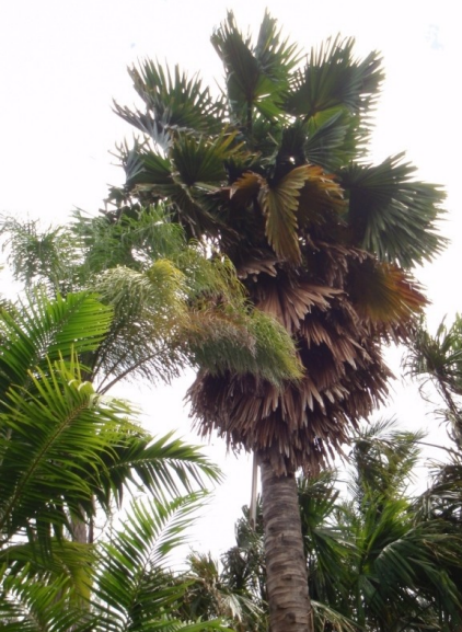
A rare Pot-Tail Palm from Sumatra at the Botanical Gardens