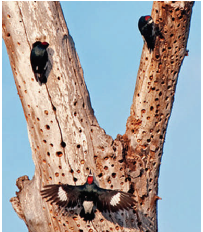
Male Acorn Woodpecker showing full wing span as he lands at the granary. Female on right side above.