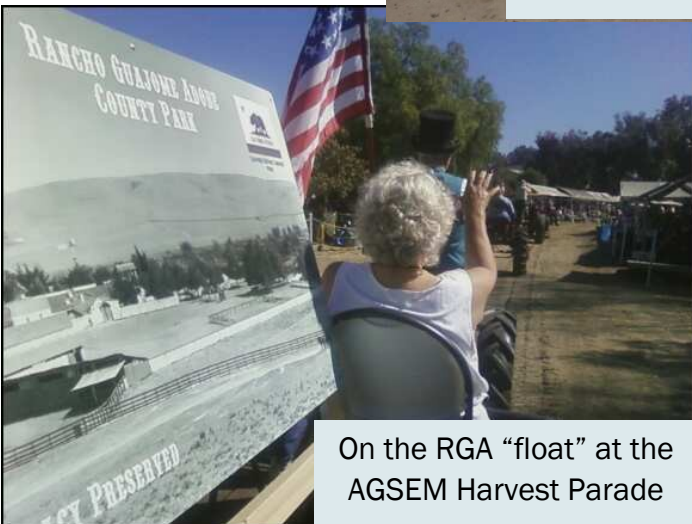
On the RGA "float" at the AGSEM Harvest Parade