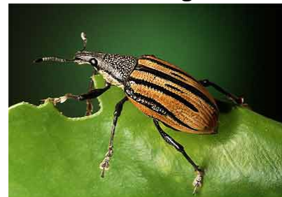
Diaprepes Root Weevil