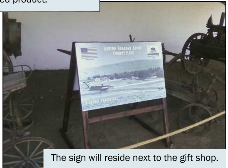
The sign will reside next to the gift shop.