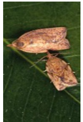
Light Brown Apple Moth