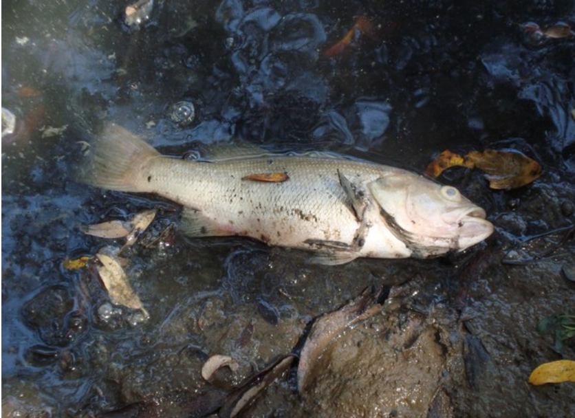
Above: A dead fish found at the Los Peñasquitos Lagoon is a casualty of the sewage spill that occurred following the San Diego County-wide blackout.

I was hiking with my sisters in the White Mountains of New Hampshire when the call came. It was Union-Tribune Reporter Mike Lee calling to get my reaction to the spillage of raw sewage into Peñasquitos Lagoon. I had to ask “what sewage spill?” I hadn’t been following San Diego news while on vacation and didn’t know about it. But, as Yogi Bear put it, it was “deja vu all over again,” because the old Pump Station 64 was the source of many spills in the 1980s and 1990s. The relatively new Pump Station 64 was suppose to end this sorry record of spills.